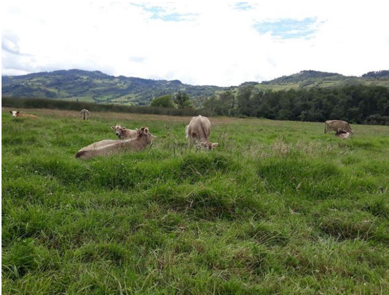
Figure 2: Evaluated Brown Swiss cattle raised in open fields and fed green forage

Fecal samples (approximately 100 g) were collected directly from the rectum of the animals using sterile obstetric gloves. Each animal was restrained by the owner with the help of a rope, trying to cause the less pain as possible, with hands covered with latex gloves and the perianal region was washed with soap and water. The samples were transported to the Immunology Laboratory of the Faculty of Veterinary Sciences, National University of Cajamarca (Universidad Nacional de Cajamarca) in an expanded polystyrene box with cooling gels (2 to 4 °C). The transfer time lasted between 8 and 10 h. In the laboratory, they were kept refrigerated at 4 °C until processing after 24 h. Clean and labeled materials were used to avoid cross-contamination.