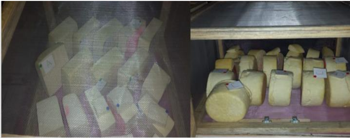
Figure 1: Prens cheese in rectangular and cylindrical shapes

PC has been produced for more than 100 years in southwestern Mexico, mainly in the Costa Chica region of the state of Guerrero in the municipalities of Cuajinicuilapa and Ometepec, as well as in the municipality of Pinotepa Nacional, on the coast of the state of Oaxaca (15) . According to INEGI (16) , the climate of the Costa Chica region is warm subhumid, and its temperatures range from 22 to 28 °C.