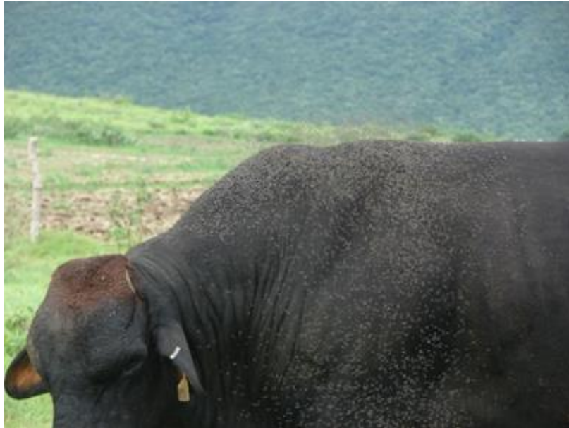
Figure 2: Haematobia irritans infestation on the upper neck and scapular areas of a dark-skinned bull.