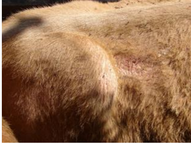
Figure 1: Severe skin damage, including alopecia and hyperkeratosis, in a cow without ectoparasite treatment during the season of highest intensity of Haematobia irritans in the northern Gulf of Mexico region

piercing the host's skin, this hematophagous action produces damage and a reduction in skin quality (3) . Skin damage includes blackheads and orifices, in which most damage is apparently due to dermal inflammatory responses (Figure 1). Eosinophilic infiltration, eosinophilic folliculitis, and furunculosis with alopecia can occur at the feeding site (6) .